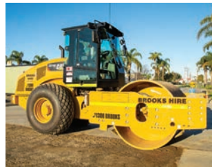
Smooth Drum Vibrating Rollers