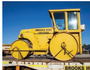
3 Pin Static Rollers