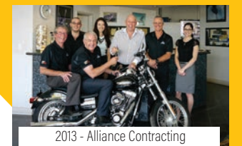
2013 - Alliance Contracting