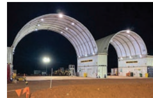
Portable Building Hire