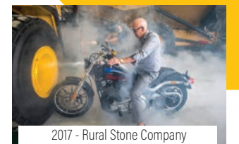
2017 - Rural Stone Company