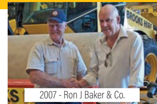
2007 - Ron J Baker & Co.