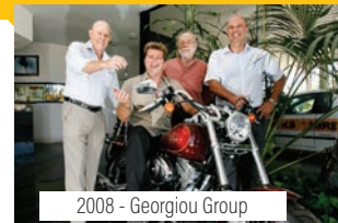
2008 - Georgiou Group