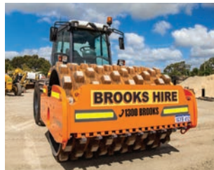
Padfoot Vibrating Rollers