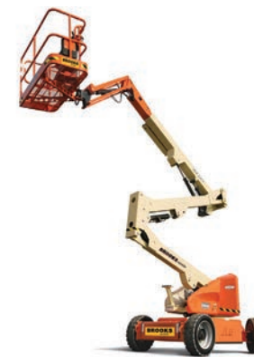
Knuckle / Articulated Booms

We stock access equipment in the following categories..