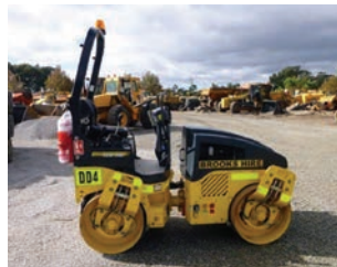
Double Drum Vibrating Rollers