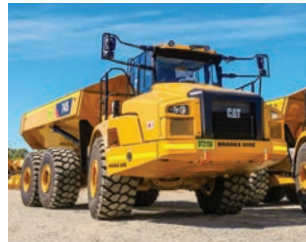
Artic. Dump Trucks