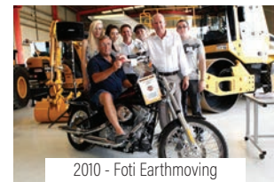
2010 - Foti Earthmoving