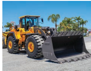
Wheel Loaders & Tool Carriers