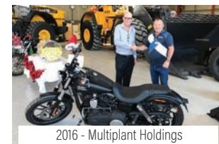
2016 - Multiplant Holdings