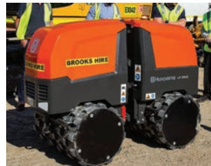
Remote Control Trench Rollers