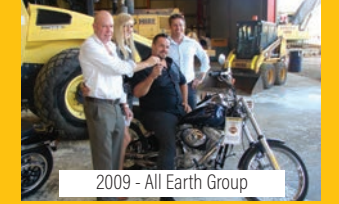
2009 - All Earth Group