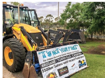
'It's NOT Your Fault 4 Kids'