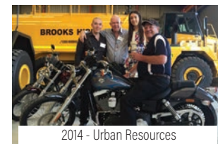
2014 - Urban Resources