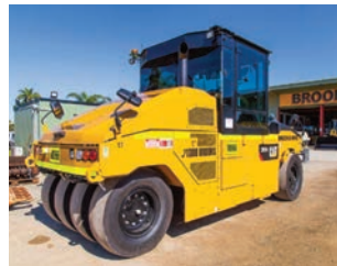
Multi Tyre Pneumatic Rollers