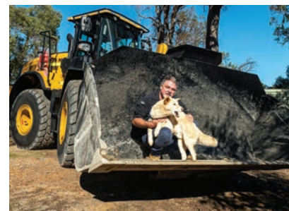
Kaarakin Conservation Centre