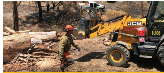
Adelaide Hills Bushfire Cleanup

We support many charity groups, voluntary organisations, community groups and sporting clubs at a grass roots level, fostering community spirit and engagement. From providing donations to lending our machinery, our involvement with the community stretches far and wide.