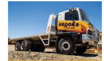
Freight Trucks & Trailers