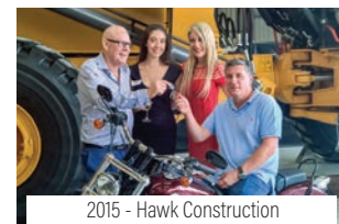
2015 - Hawk Construction