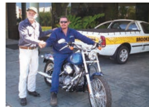
2005 - Shire of Victoria Plains