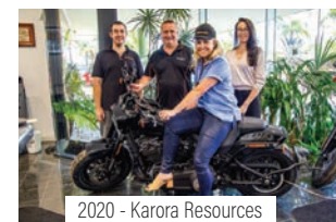
2020 - Karora Resources