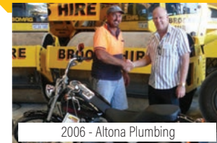
2006 - Altona Plumbing