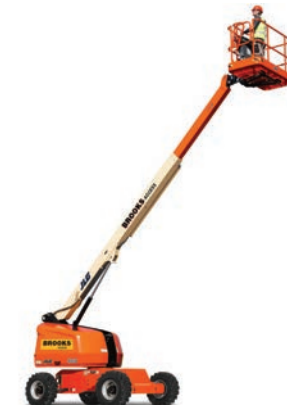
Straight / Telescopic Booms