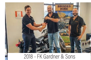
2018 - FK Gardner & Sons