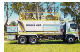
Fuel Trucks and Trailers