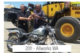
2011 - Allworks WA