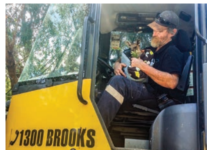
Mandurah Wildlife Rescue