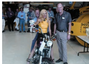
2003 - Complete Underground Power