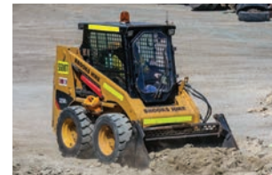
Skid Steer Loaders & Attachments