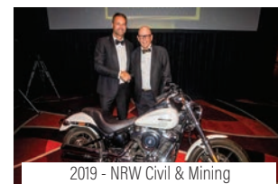
2019 - NRW Civil & Mining