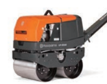
Double Drum Rollers