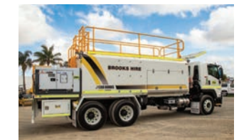
Service Trucks & Trailers