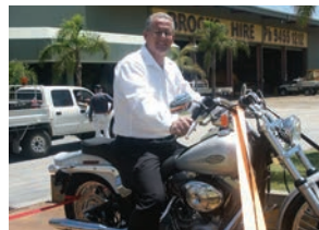
2004 - City of Fremantle