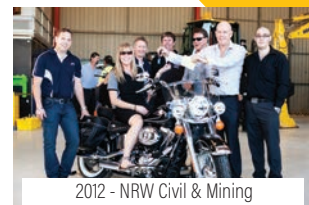
2012 - NRW Civil & Mining